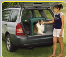
Front & Side Zippered Mesh Doors