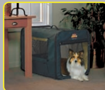
Outdoor & Indoor