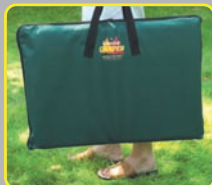
Includes Carrying Tote