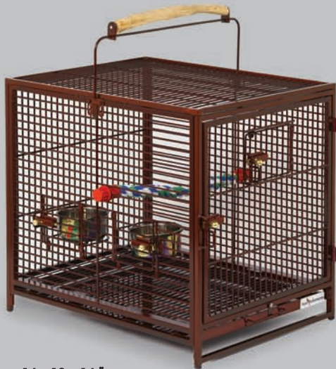
14 x 18 x 14 " Shown in Ruby

For Small to Medium Birds 1/2" Bar Spacing