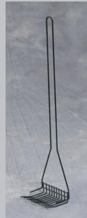
66 Waste Rake